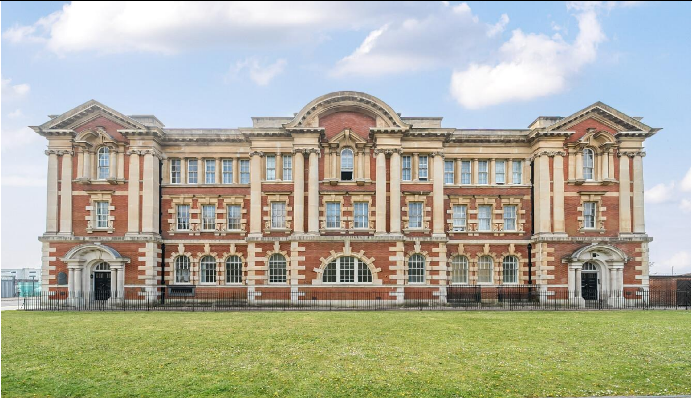
Admiralty House, Platform Road, Southampton, Hampshire, SO14 3FU