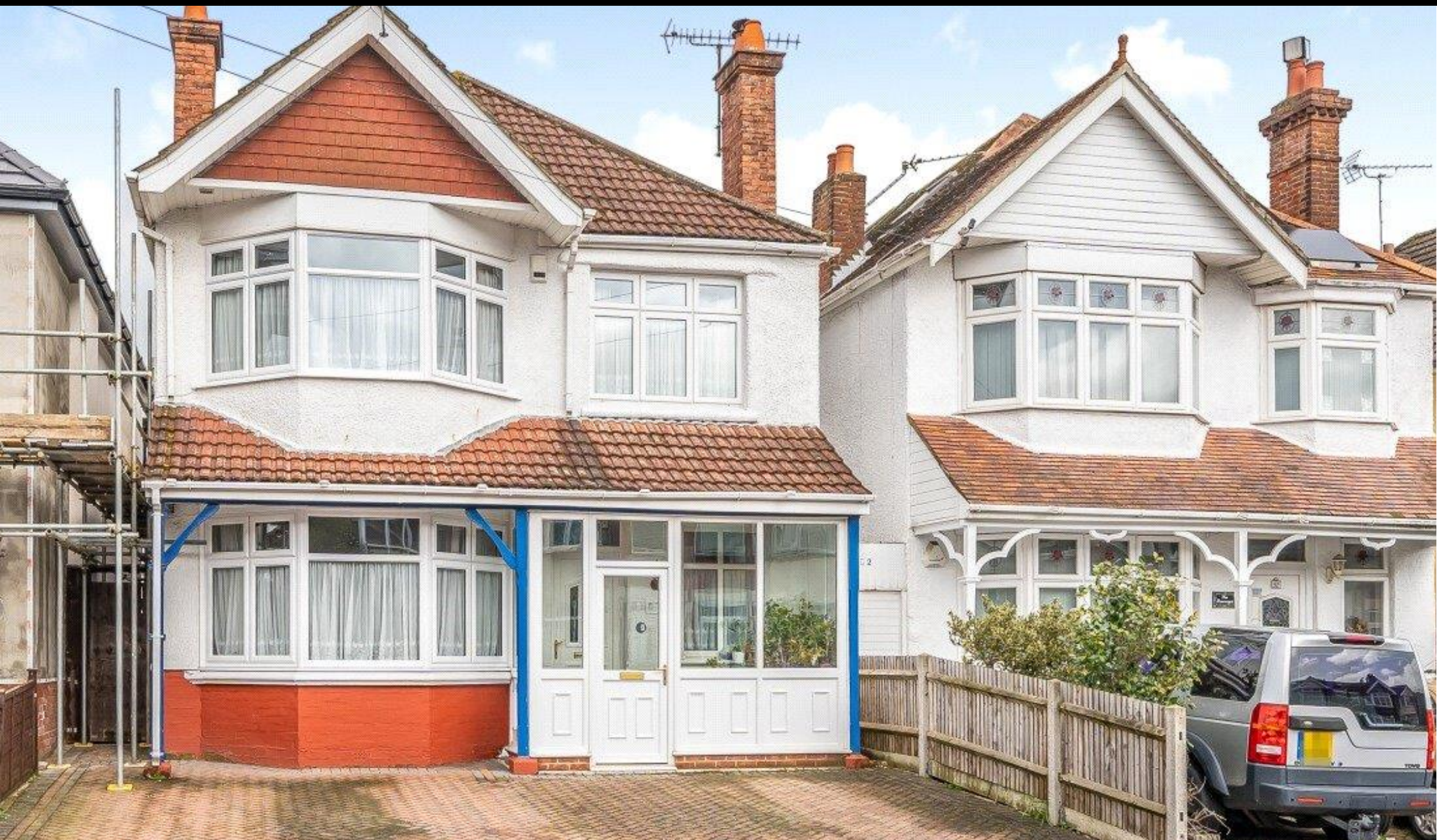
St. James Road, Upper Shirley, Southampton, Hampshire, SO15 5FF