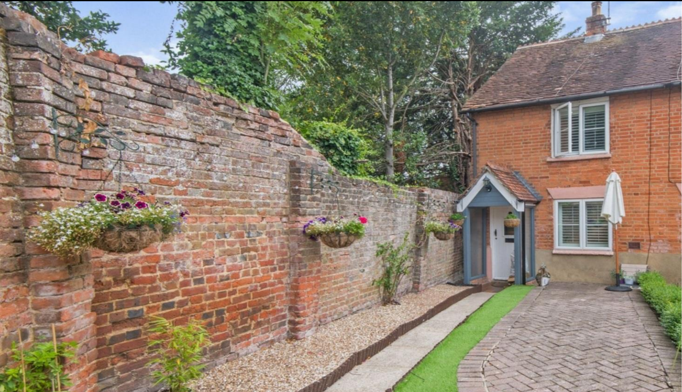
The Hundred, Romsey, Hampshire, SO51 8BX