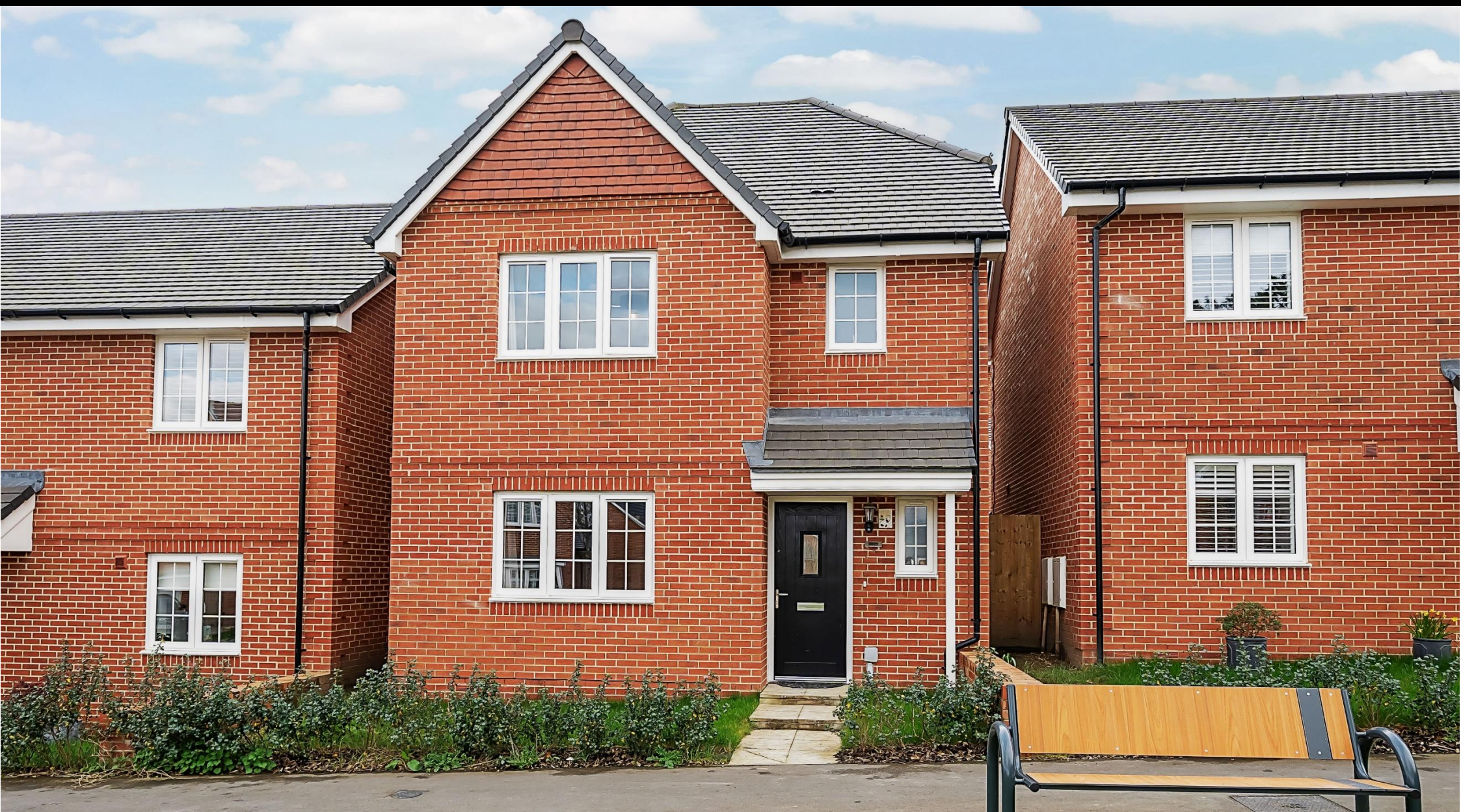
Walton Close, Alton, Hampshire, GU34 1GY