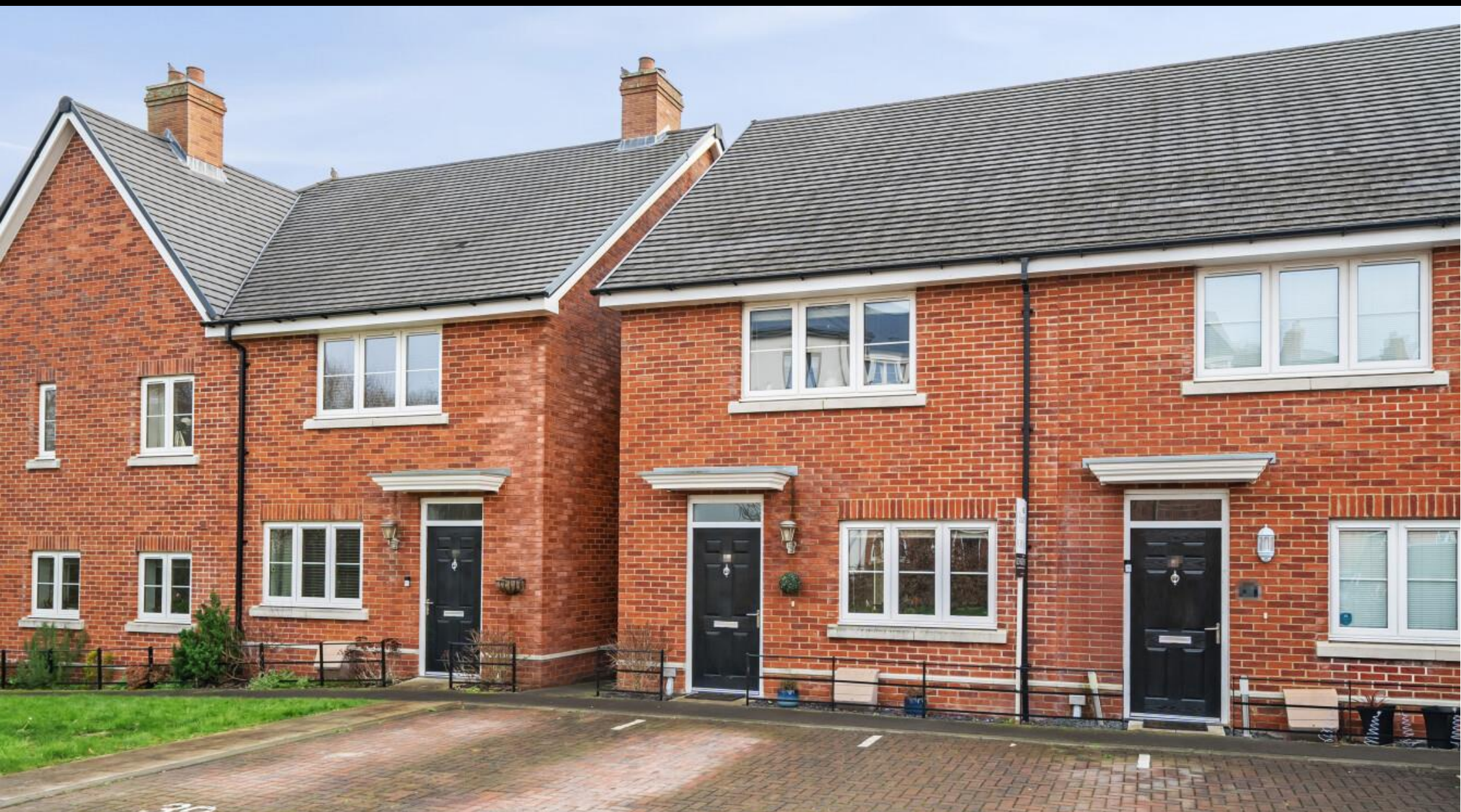
Lewis Road, North Stoneham Park, North Stoneham, Hampshire, SO50 9RJ