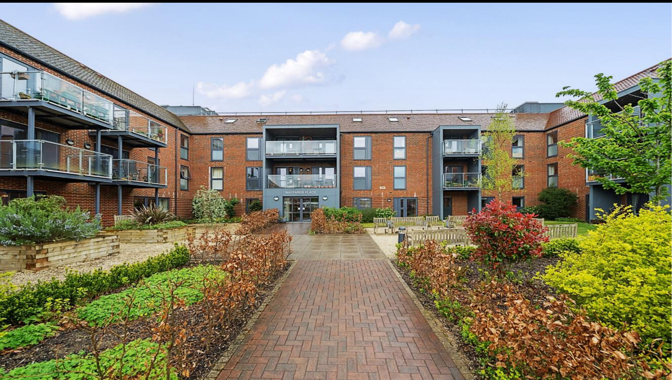
Wayfarer Place, The Dean, Alresford, Hampshire, SO24 9FT