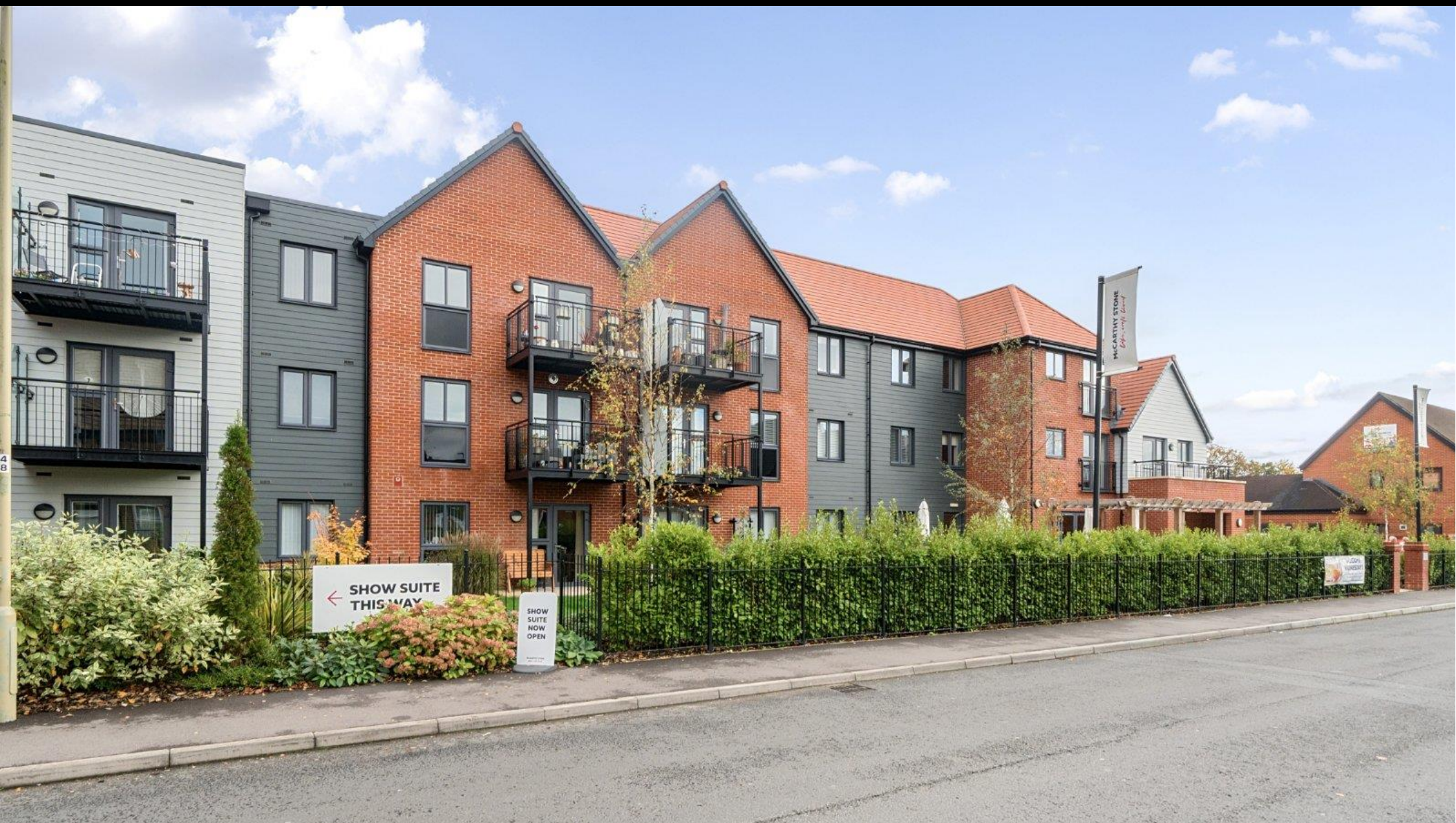
Apartment 18 Glebe Court, Glebe Court, Romsey, Hampshire, SO51 0ES