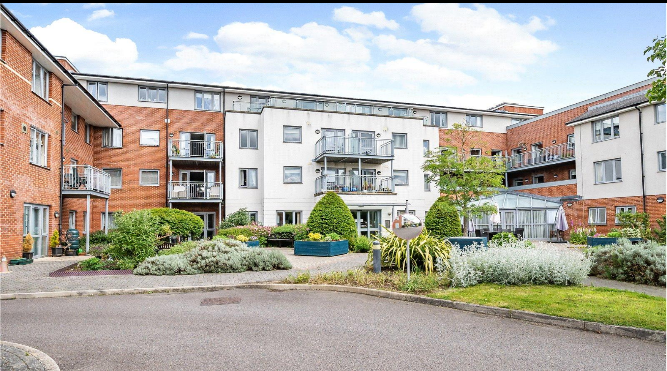
Catherine Court, Sopwith Road, Eastleigh, Hampshire, SO50 5LN