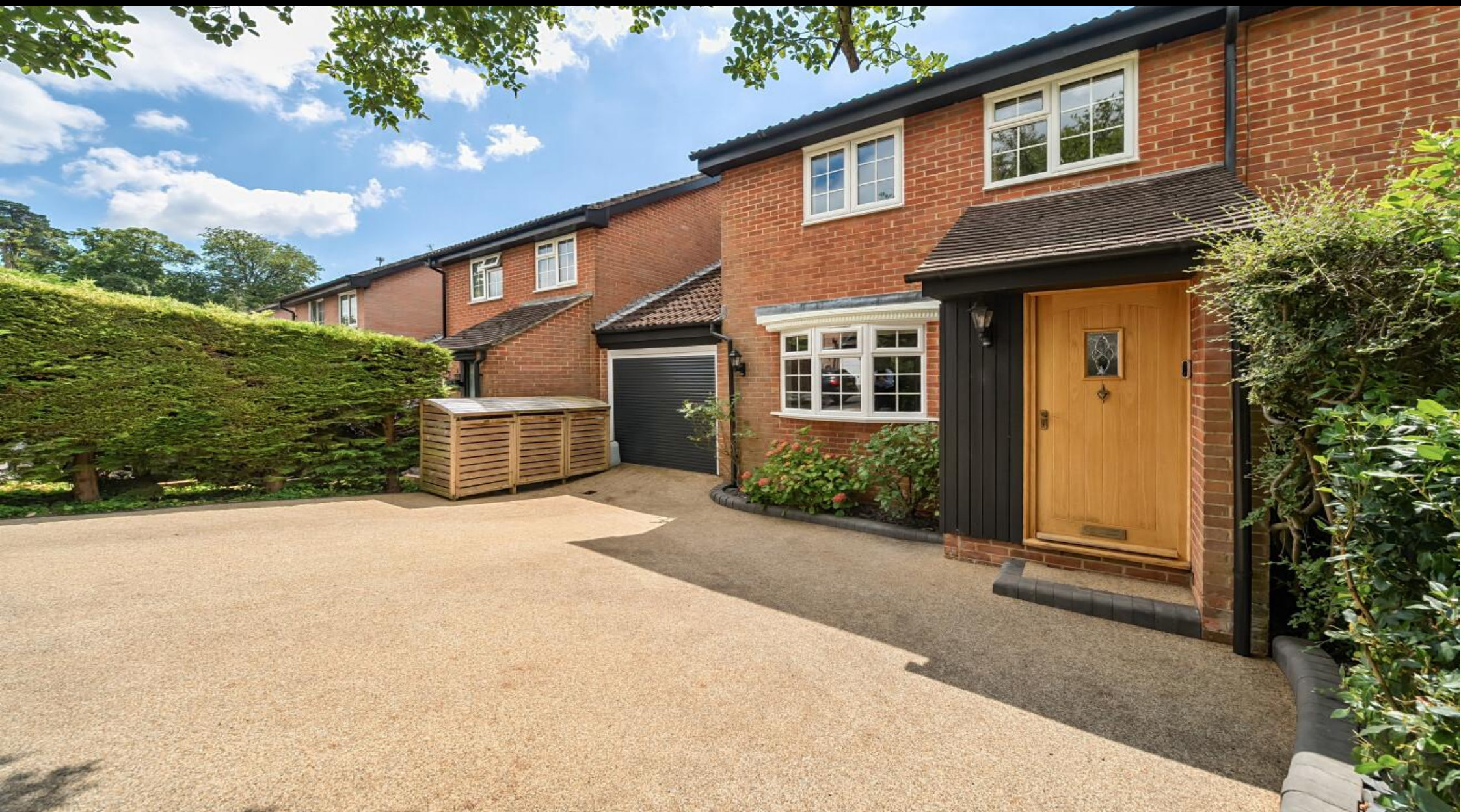
Bossington Close, Rownhams, Southampton, Hampshire, SO16 8DW