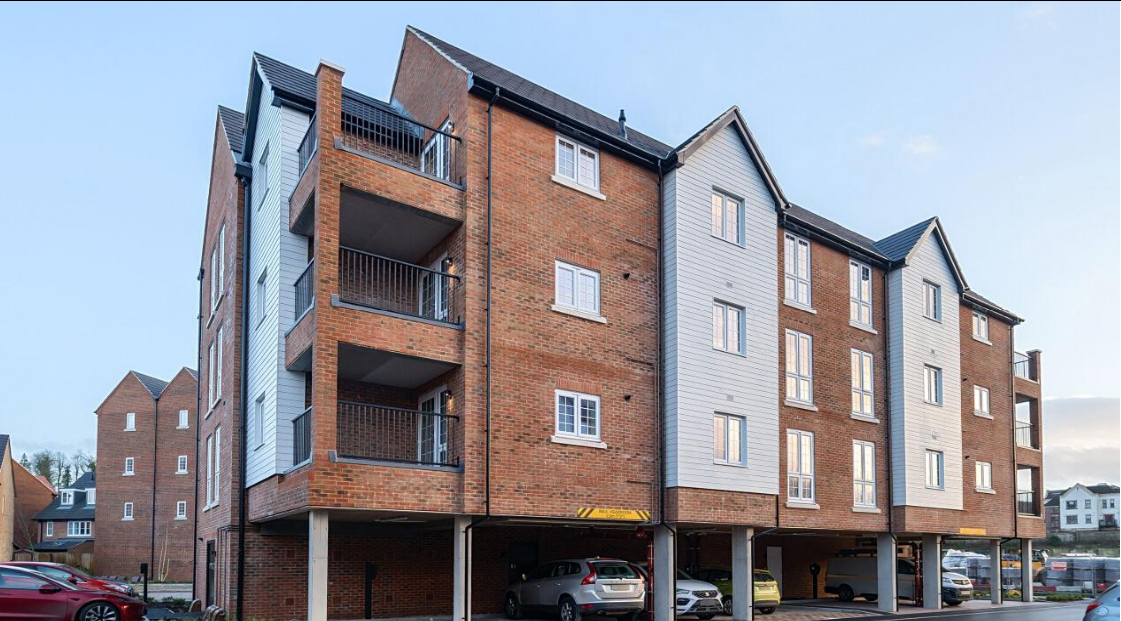
Guinness Court, Harp Avenue, Alton, Hampshire, GU34 1US