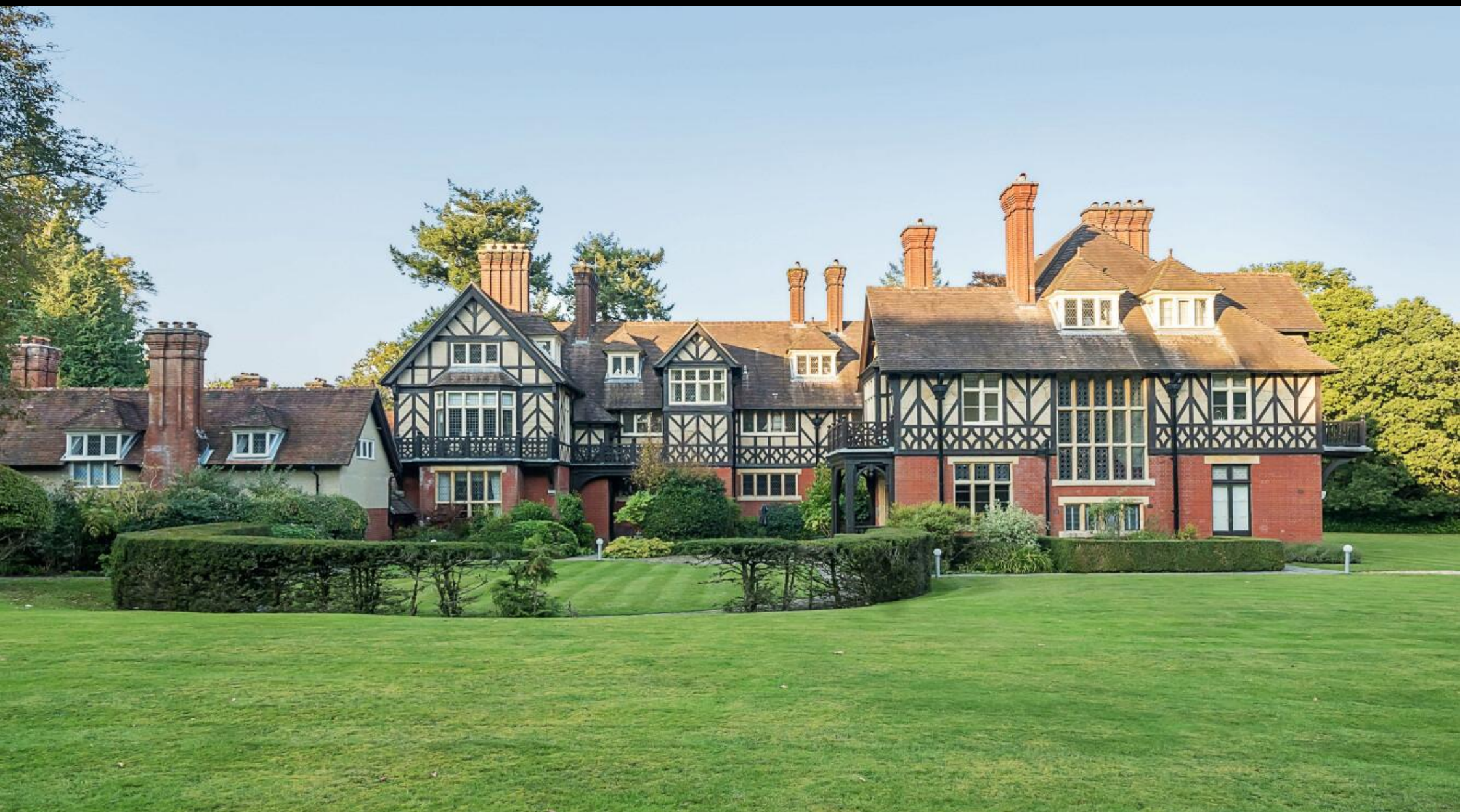
Castle Malwood Lodge, Minstead, Lyndhurst, Hampshire, SO43 7HB