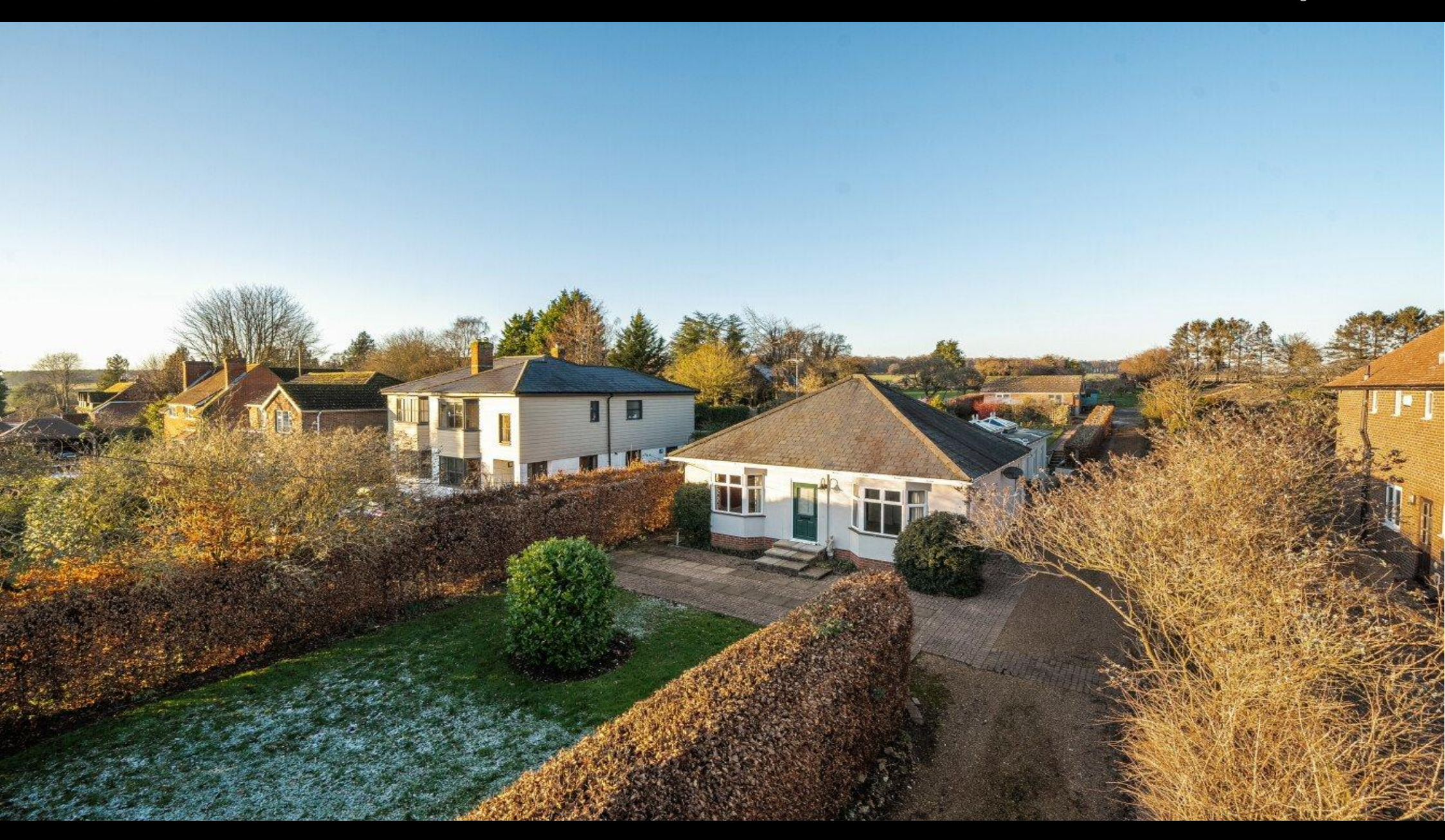
Gascoigne Lane, Ropley, Alresford, Hampshire, SO24 OBT