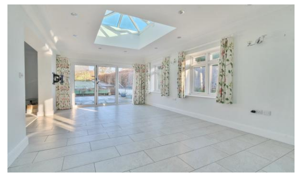
LOCAL AUTHORITY East Hampshire Council Tax Band F