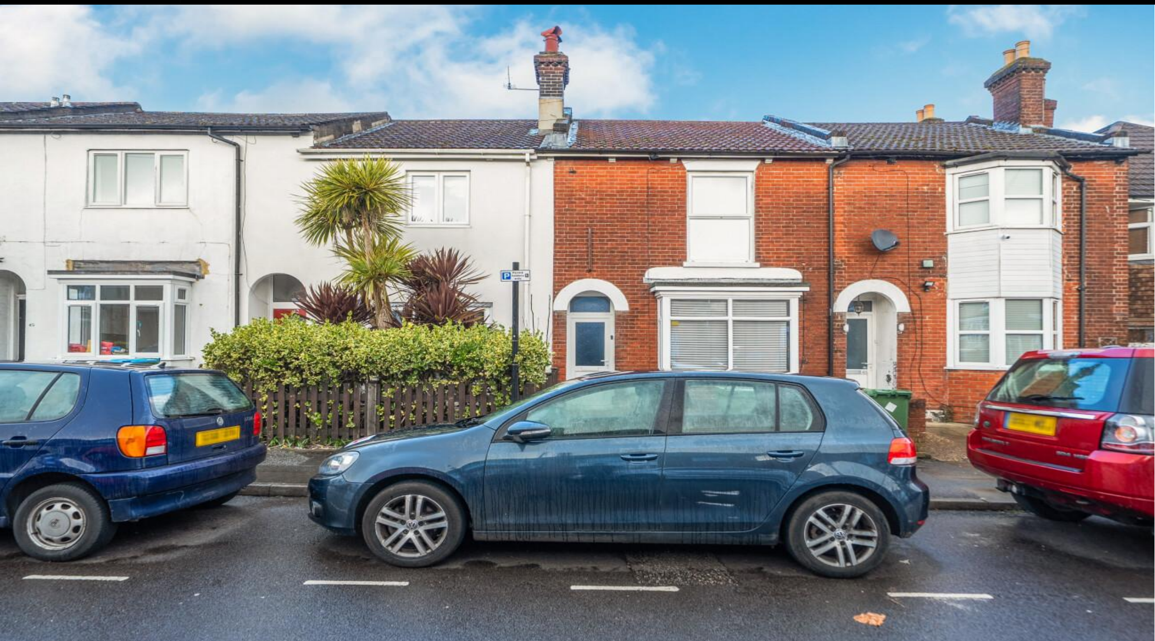
Padwell Road, Inner Avenue, Southampton, Hampshire, SO14 6RA