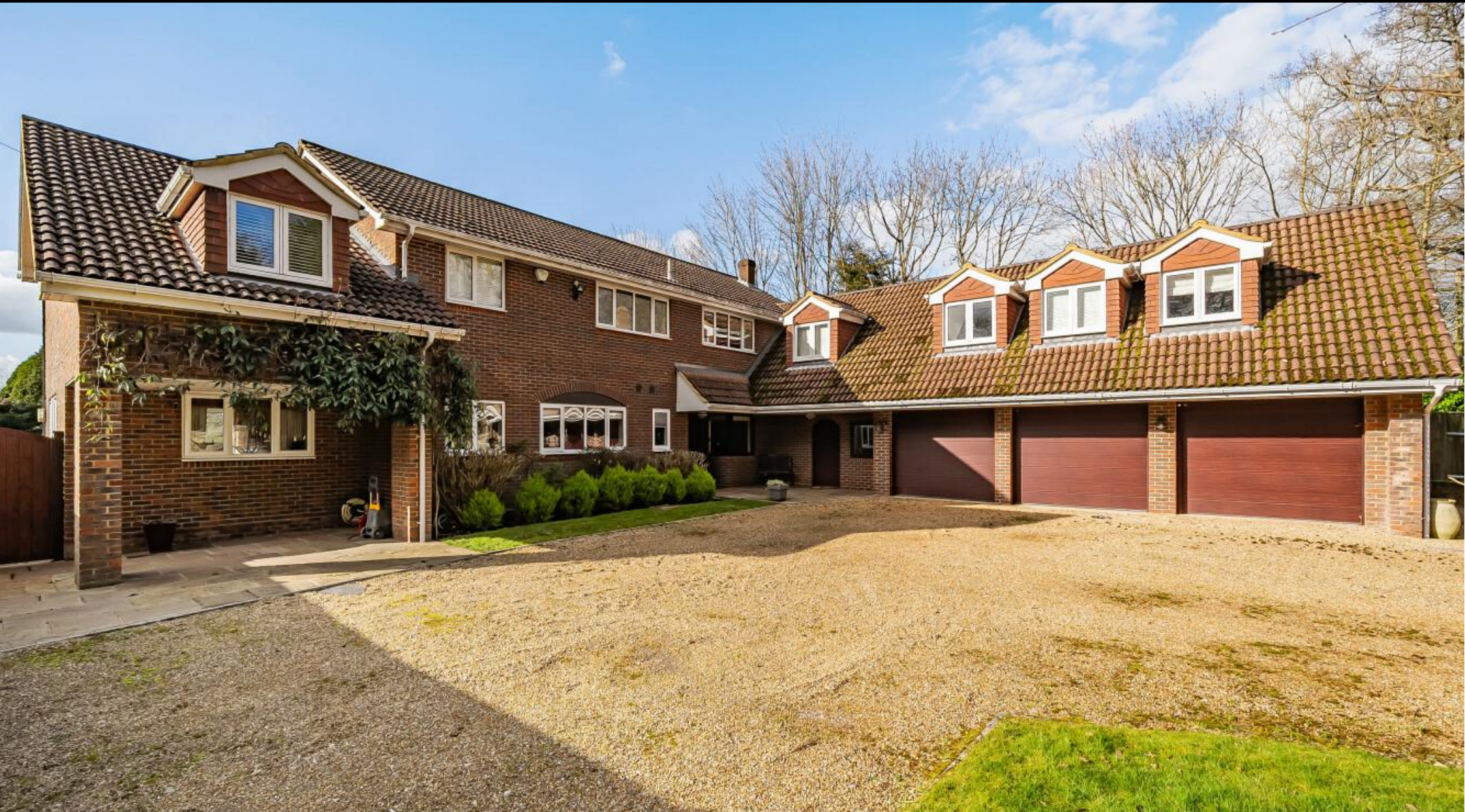
Holly Hill Lane, Sarisbury Green, Southampton, Hampshire, SO31 7AF