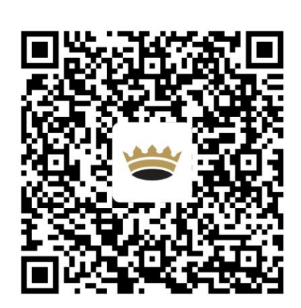
Scan the QR code to find out more information about this property.