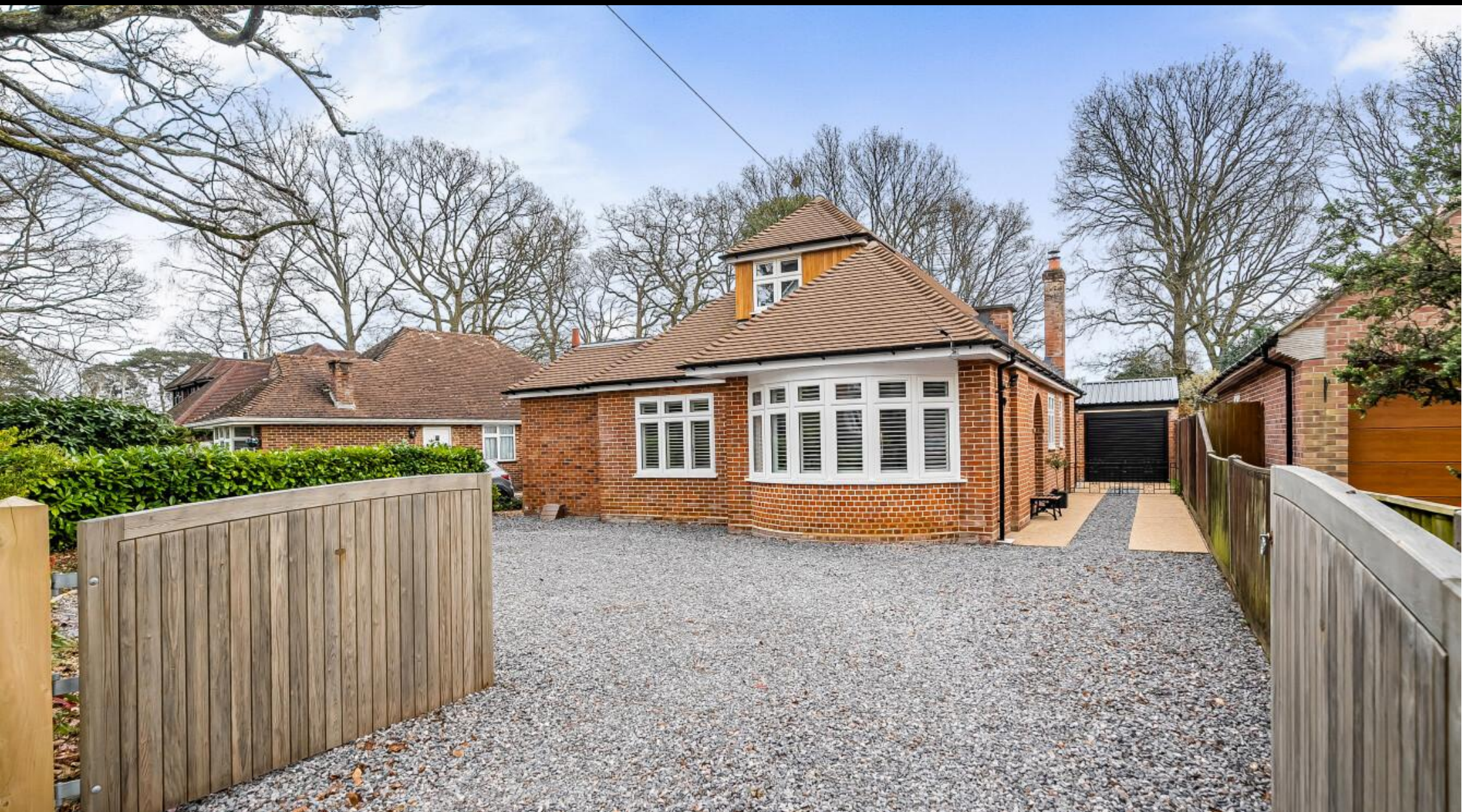
Brownhill Road, Chandler's Ford, Eastleigh, Hampshire, SO53 2FL